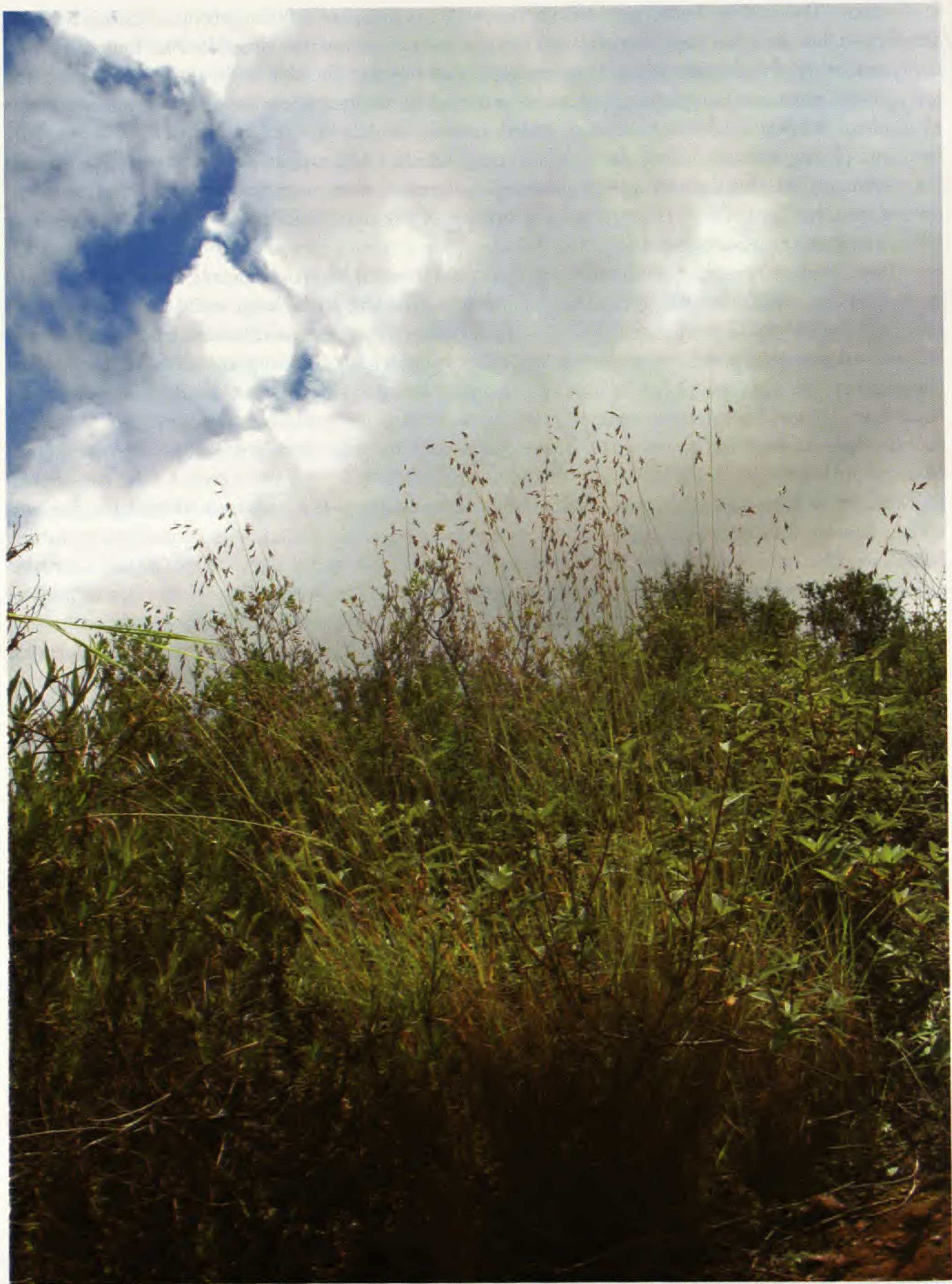
FIG. 3. Habit of Poa ramifer [P.M. Peterson & R.J. Soreng 21804 (US)] in situ.